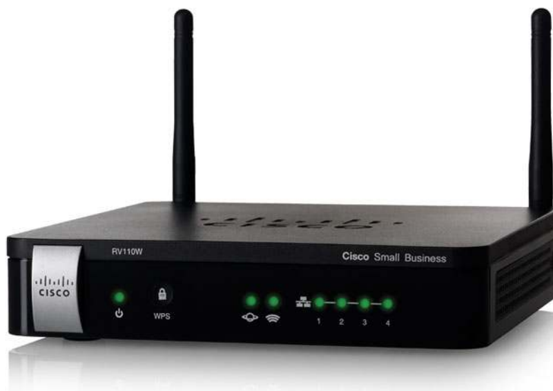
Figure 1. Cisco RV110W Wireless-N VPN Firewall

The Cisco® RV110W Wireless-N VPN Firewall provides simple, affordable, highly secure, business-class connectivity to the Internet for small offices/home offices and remote workers.